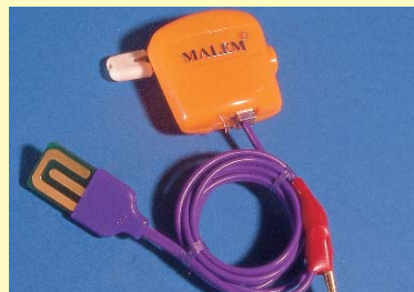
Malem Standard Sensor

Medical Devices Agency, January 1998, Disability Equipment Assessment, Enuresis Alarms, An Evalution.