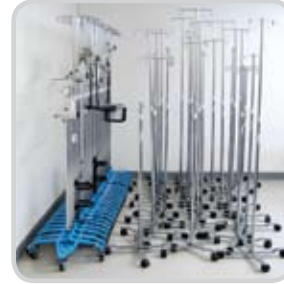
SmartStack stores less than half the space of traditional I.V. poles! (shown above: 24 of each)