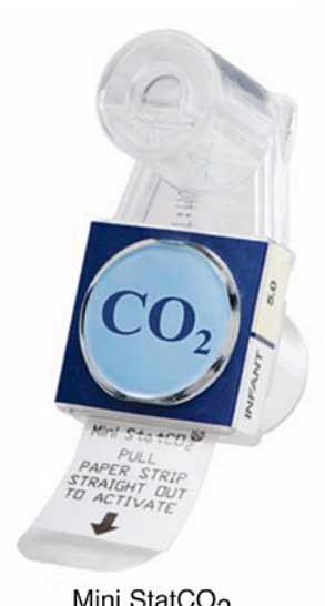
Mini StatCO 2 1 - 15 kgs body weight