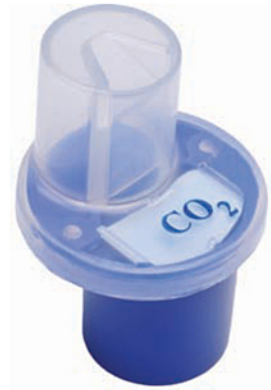
Neo-StatCO 2 0.25 kg to 6 kgs body weight