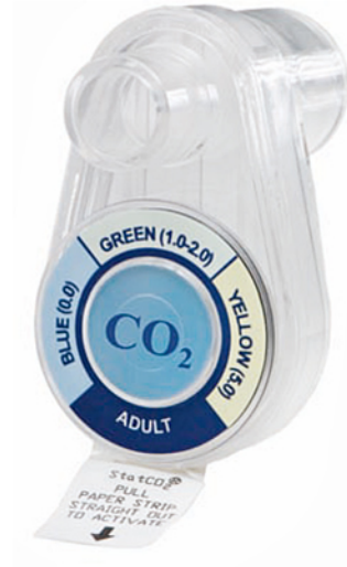
StatCO 2 Over 15 kgs body weight

All CO 2 Detectors are Single-Patient-Use